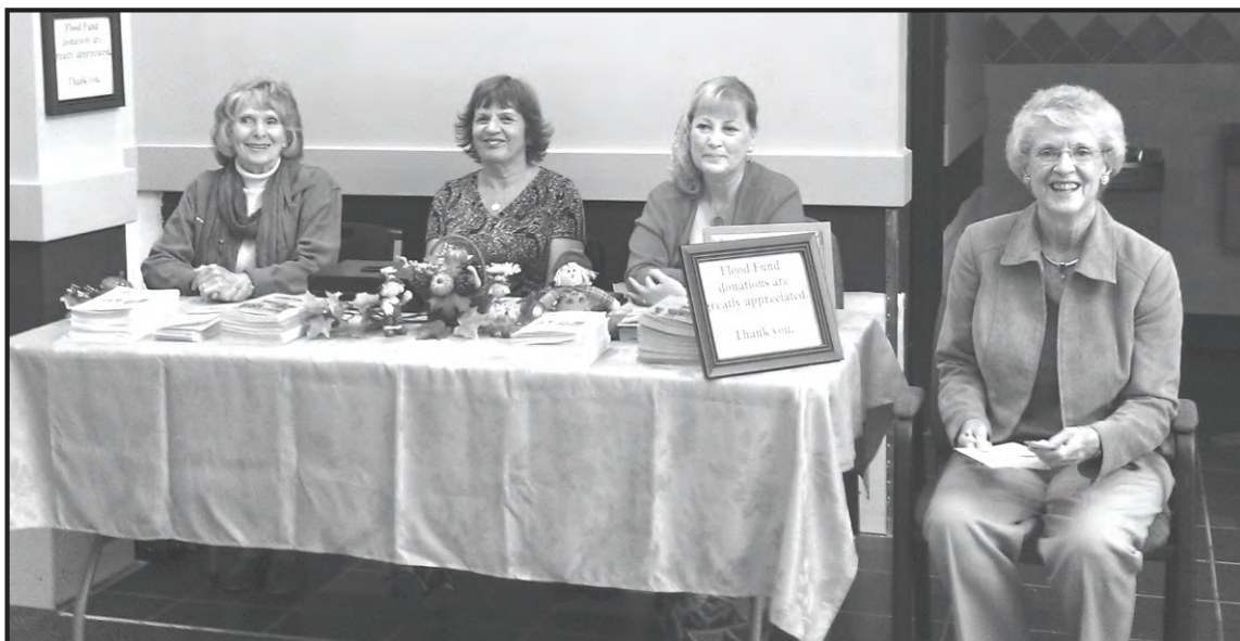
Ladies of the Dietrich get set for the crowd with the Fall Film Festival Gala Night.