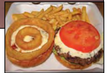
The Ringo Burger pictured above, as well as other menu items available for take-out at JACS Creamery and Eatery.