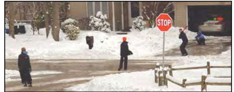
Even 5 inches of snow didn't seem to hamper these Back Mountain baseball players.