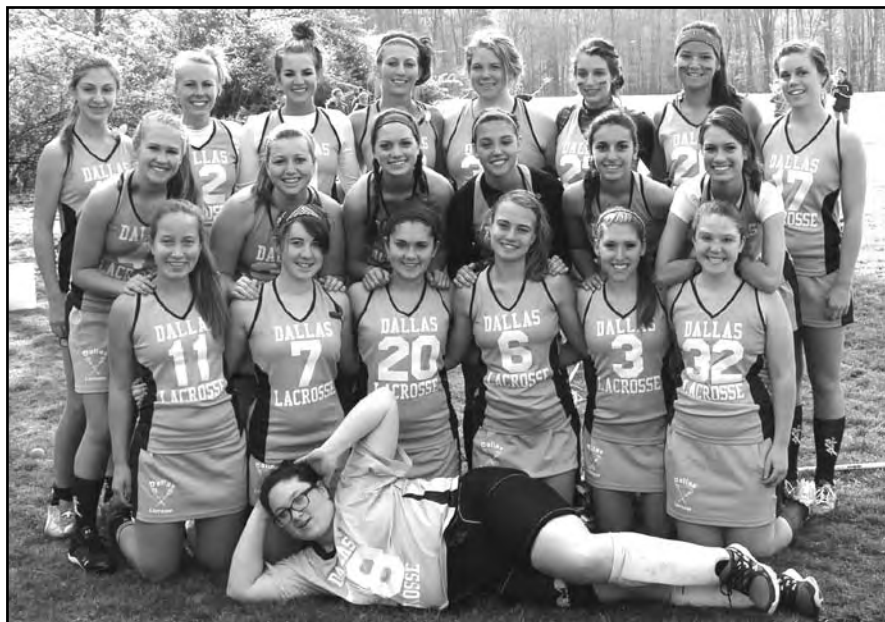
Above in photo are: Dallas members of the girls Lacrosse team.