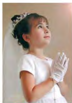
Beautiful New Crosses & Communion Gifts!