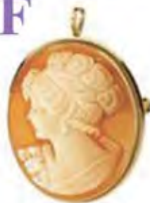
Timeless treasures especially for Mom! Choose from a large selection of Estate Jewelry.