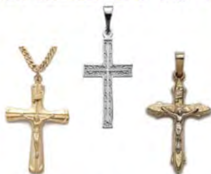
Available in Silver & Gold.