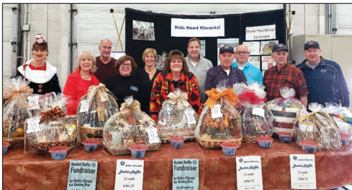
All photos above are from previous year's Kiwanis Club Halloween festivities.